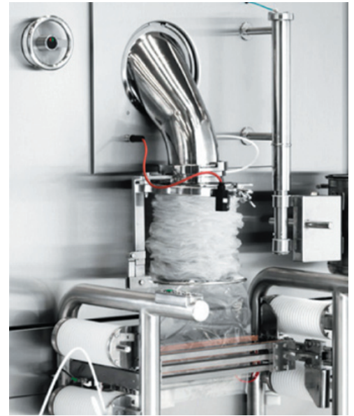
5. Install the liner on the adapter and pull it through the welding brackets.