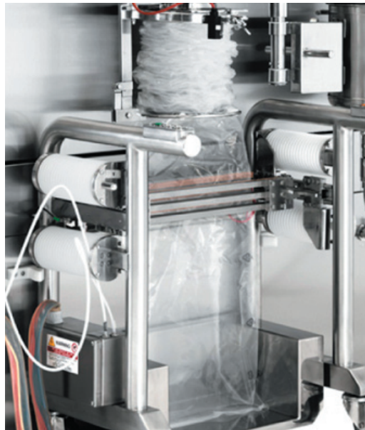
6. After welding, pull the liner all the way down until it reaches the scale.