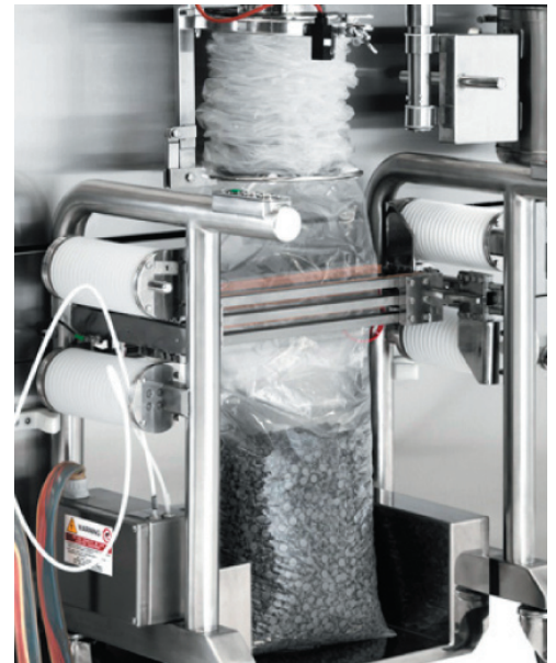
7. The closures are discharged inside the liner. When the desired volume is reached the interface stops the drum inside the chamber. Weld the liner and repeat the operation until the batch has been bagged.